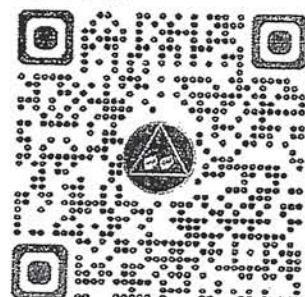
Deaf Alcoholic Recovery Stories