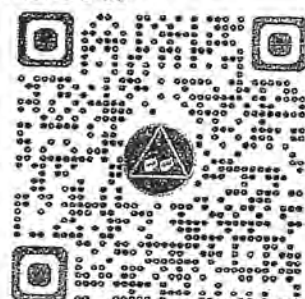
Deaf Alcoholic Recovery Stories